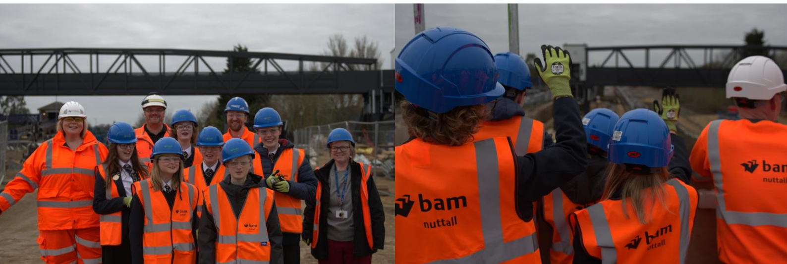
Students, Network Rail and BAM staff at Eaglescliffe station

This was not only a fantastic experience for the students, but the project team enjoyed the opportunity to engage with the young people and share their passion for the work they are doing on the Eaglescliffe Station AFA Scheme.