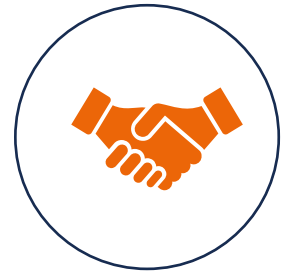
'Because I Care' Award