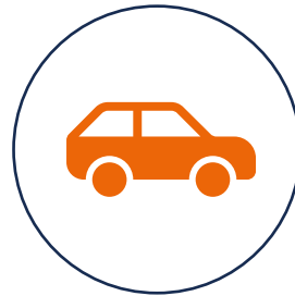
Occupational Road Risk