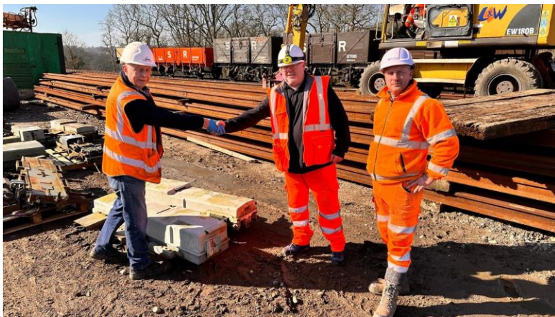
Bluebell Railway Trust and ALSTOM