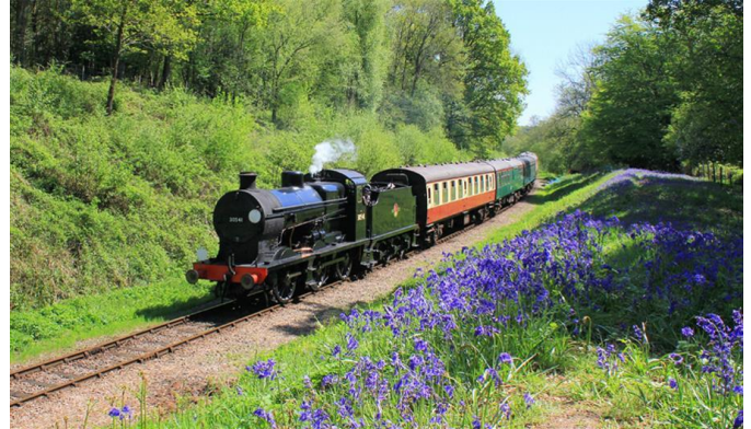
The Bluebell Railway

The Railway is funded by donations from members and friends together with generous public support. The Bluebell Railway Trust is a registered charity, and it is responsible for administering all donations received on behalf of the Railway.