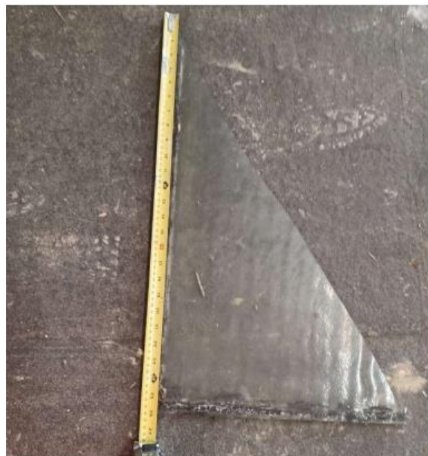
Image: glass that fell from the window.